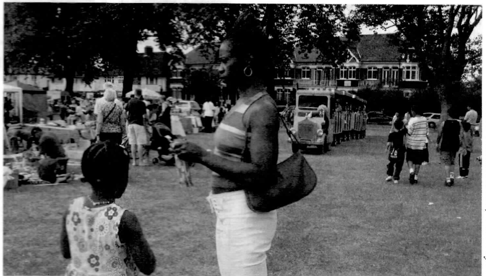
2003 Fayre

Stalls at the Fayre: To request an information/application form leave your name and address on 07758 464 195