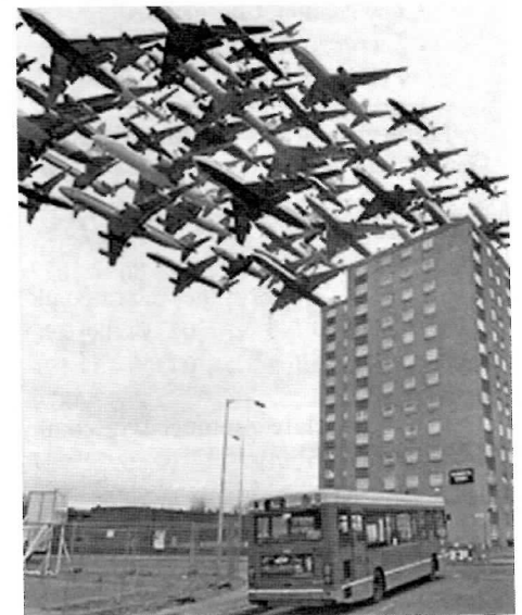
A tower block in Hounslow showing the actual planes which went over during the course of one hour