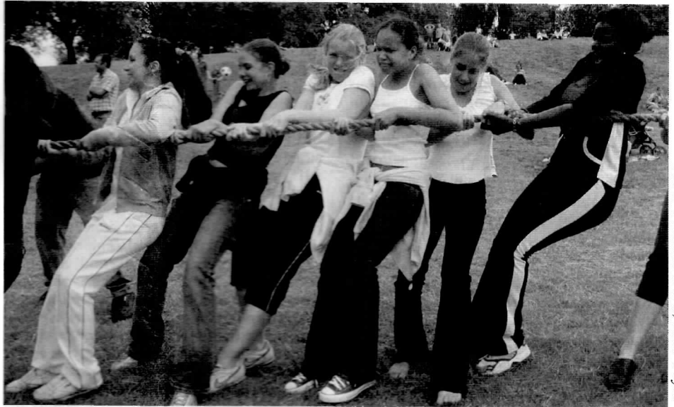
2003 Fayre

Everyone living in the Brockley Conservation area is automatically a member of the Brockley Society. The Brockley Society welcomes all.