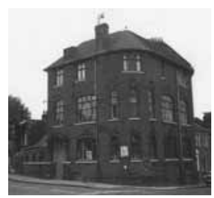
The Whidbourne Institute, 1920s and 30s, formerly on the corner of attended Boys Friendly Street and Albyn Brigade here, Road, now part of the and when he Peabody Estate was older,

As an historical aside – one of the buildings that had been demolished for the Peabody estate was the Whidbourne Institute. This was a charitable clubhouse that provided facilities