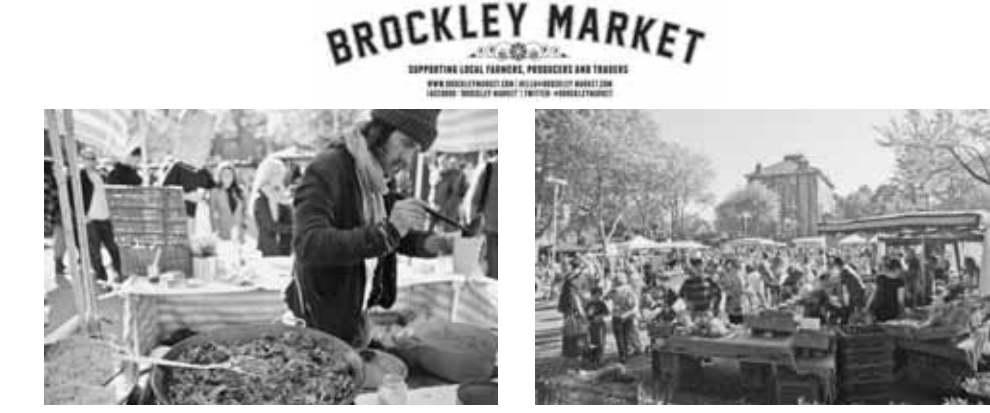
Every Saturday morning crowds gather in Lewisham College car park to shop at Brockley Market, now an established part of Brockley's social life. Eat delicious street food while you buy fresh vegetables, meat and specialist foods. If you haven't been there, it's high time you tried it.

www.ipetitions.com/petition/save-lewishamnurseries/