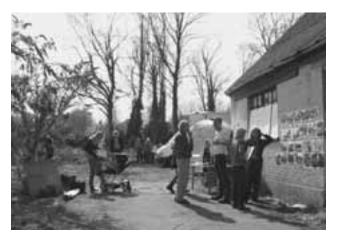
Sunshine and birdsong for the Breakspears Mews Open Day in March

We are delighted that Lewisham Council has now granted planning permission for a Community Garden to be created at the end of Breakspears Mews.