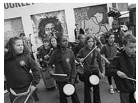
Opening Night at Brockley Max