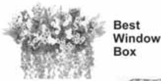
Best Window Box