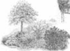
Best Front Garden