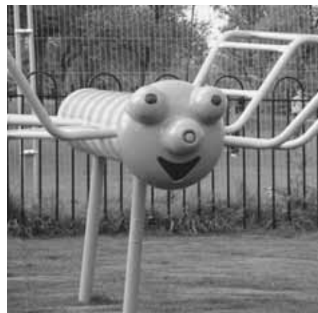
Even our spider is smiling now - I think she likes her new coat.

encourages play beyond the apparatus. We want children to be able to choose and experience a wide range of play opportunities and give them the chance to explore and interact with the physical world around them. By creating a natural environment within the playground, we will provide the setting for a free play experience that is constantly changing.