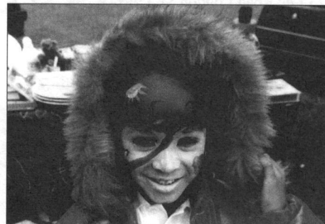
face painting at the Fayre

All these attractions as well as the regular (legendary) Cake Stall (please start baking now!), ice cream and numerous food stalls.