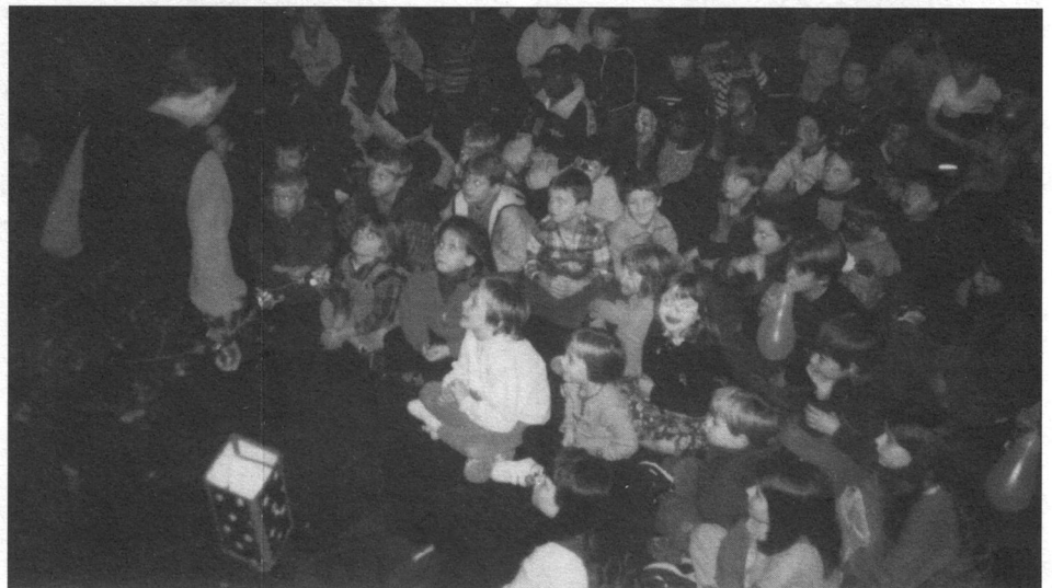
it's Xmas party time in Brockley