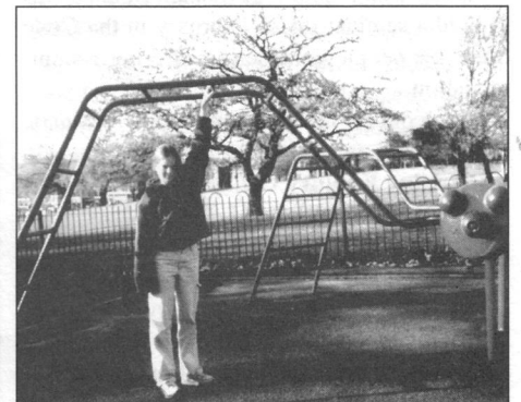
Anna and Ava: too tall to enjoy the playground