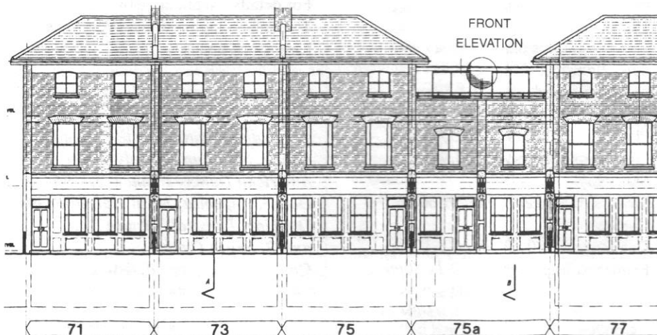
Plans of the original front elevation for 71-77 Upper Brockley Road by Architecture Limited. There may be some modifications by the newly appointed architects.

The current scheme is to provide one 3-bedroom house with a roof terrace and four 4-bedroom houses – all with front and rear gardens. Most welcome is the plan to avoid parking problems for the rest of the residents in the street by making room for cars in the rear gardens. However, there is still slight concern about where the wheely-bins for each new house are going to be placed. Cantor Developments recently sold on the project to a new firm and a fresh planning application has been made to extend the 3-bedroom house. The Brockley Society will be watching future developments closely.