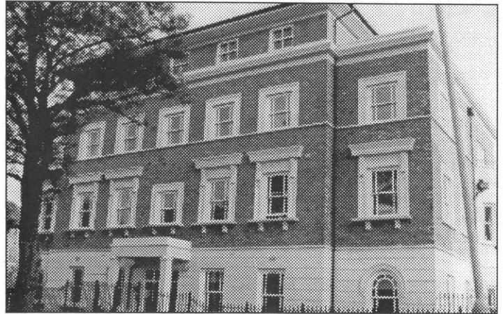
above: the recently completed Lloyd Villas ... below: ...and the original Victorian villas next door