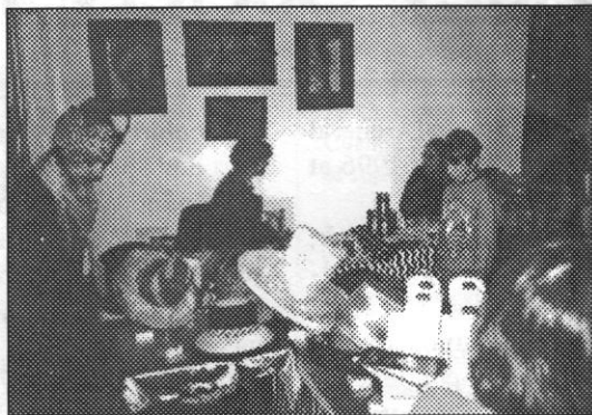
stalls at the Xmas Craft Fayre

Christmas arrived in Brockley on 30 November – the day of the Brockley Society Christmas Craft Fayre which was held at the Lewisham Art House. As in previous years, the variety and quality of the goods on offer was very high and the Fayre was well attended by visitors from all over the area.