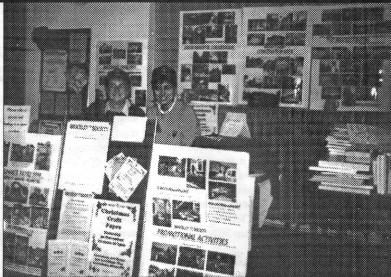
Committee members back at school

Your committee were pleased to dispatch two of its members to Prendergast School in November! Not for further education, but to represent the Brockley Society at the School's Christmas Fair.