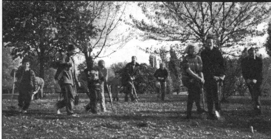
local residents have fun planting bulbs on Hilly Fields

Hilly Fields Park Users Group has been going for just over a year and anyone who is interested in the park is welcome to come to the meetings, which are held at Prendergast School on the top of Hilly Fields. The dates and times of meetings are advertised on the Park Users Group notice board next to the playground.