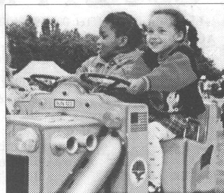
fun at the Fayre

And a special thank you to Mike Burnside from 'The Bill' for opening the Fayre and coping wonderfully with the difficult task of selecting Miss Brockley 1995, and to St John's Ambulance for providing first aid - and winning the knobbly knees competition! If we've left anyone out, we apologise profusely. Please let us know and we'll make sure you get a mention in our next newsletter.