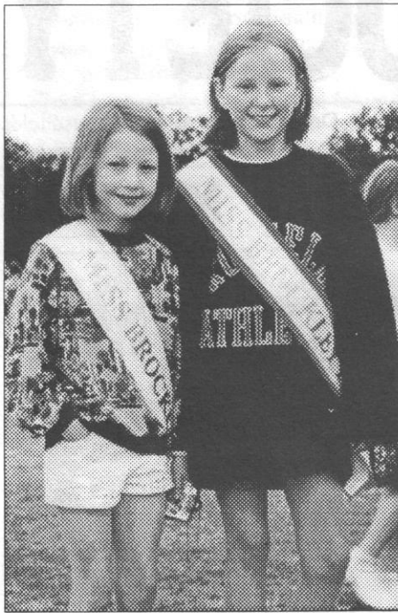
Miss Brockley Winners

Despite getting one of the few dull days this summer, the BrocSoc Summer Fayre was a great success. We'd like to say a BIG thank you to everyone on the Fayre Committee who worked so hard to get it all organised (how are you getting on with the 1996 preparations, folks?), to everyone who helped on the day, setting up stalls, taking down stalls, making the tea etc etc. And another BIG thank you to all the local business who once again supported the Fayre by donating raffle prizes, sponsoring stalls, and helping out in other ways, and helped to make it such an enjoyable community event. So thank you to: