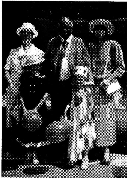
Deputy Mayor and guests at the 1992 BrocSoc 'Fayre'

At 3:45pm, there's a chance to show us what you're made of in the knobbly