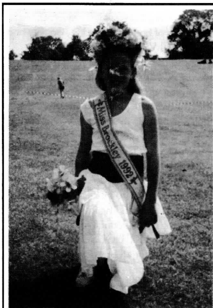
Miss Brockley 1992 - see p.2

At the AGM this year we will expand on the proposal and explain in more detail the roles and responsibilities of each Executive. Following an open debate and discussion, which is open to all we will ask for a vote on the proposal. If the proposed new structure is voted in, we will ask for nominations for the Executive posts and a vote will be taken at the AGM.