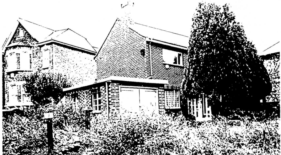
199 Wickham Rd.-Application for demolition is under consideration.