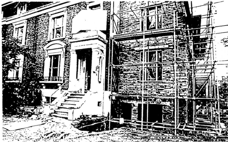
2 Wickham Rd.-This extension is the subject of controversy re-planning.

Friends of the Earth have organised a collecting skip at LADYWELL LODGE, SLAGROVE PLACE (off Ladywell Road) for every 2nd Saturday each month, 10 till 4. Take your bundles of newspapers there. Perhaps people with cars could make neighbourly arrangements to collect from those who haven't transport.