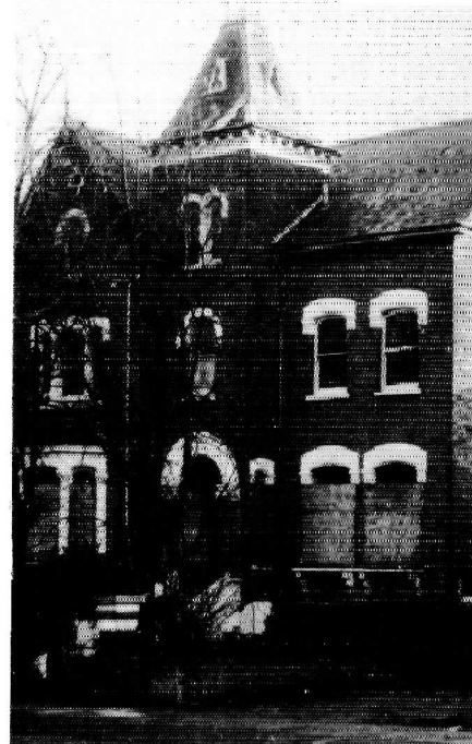
33 Wickham Road