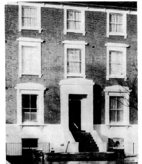
16 Wickham Road

We understand that offers have been made by the builders who have developed Bridge House in Montague Avenue but the Council will not sell, although the Chalsey Road properties back onto the Bridge House development, which is an attractive one