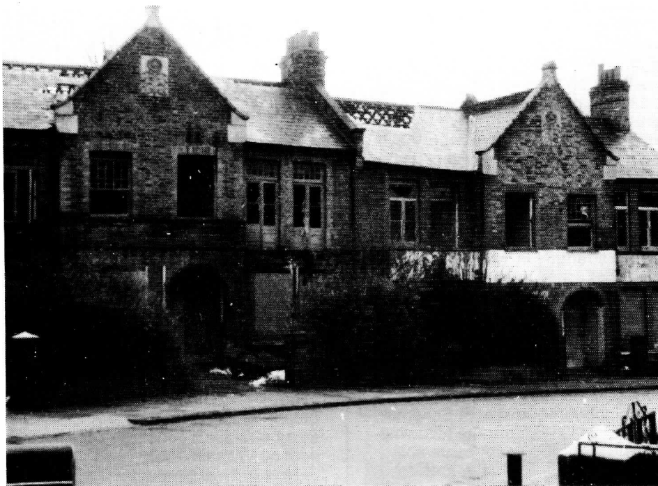
2-8 Chalsey Road

In July 1978, the Society was in contact with the Borough Council about these properties which were deteriorating, still partially tenanted, although the Council had bought them 4 years previously.