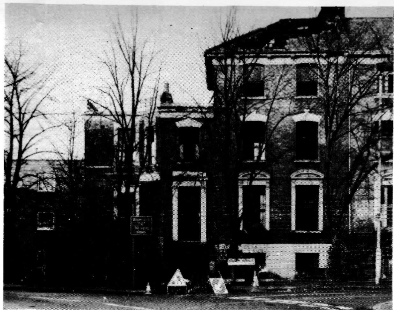
114-116 Manor Avenue

Estate Agents and Valuers Specialising in Residential Sales have constant enquiries locally and nationally for houses/flats/maisonettes 388 BROCKLEY ROAD, SE4 2BY Tel: 01 691 8731 ANYTIME Associated Office in Dulwich