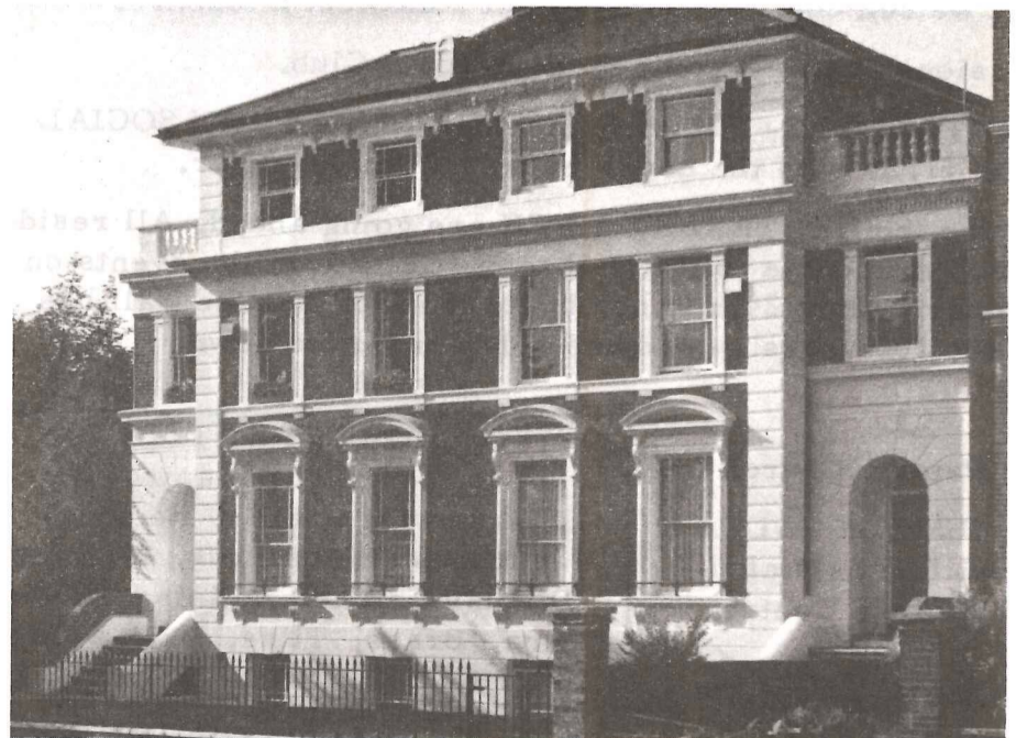
GREAT IMPROVEMENT No. 11 236/238 Lewisham Way (Beaver Housing Association)

NEWSPAPERS ONLY PLEASE - SAVE ALL YOU CAN