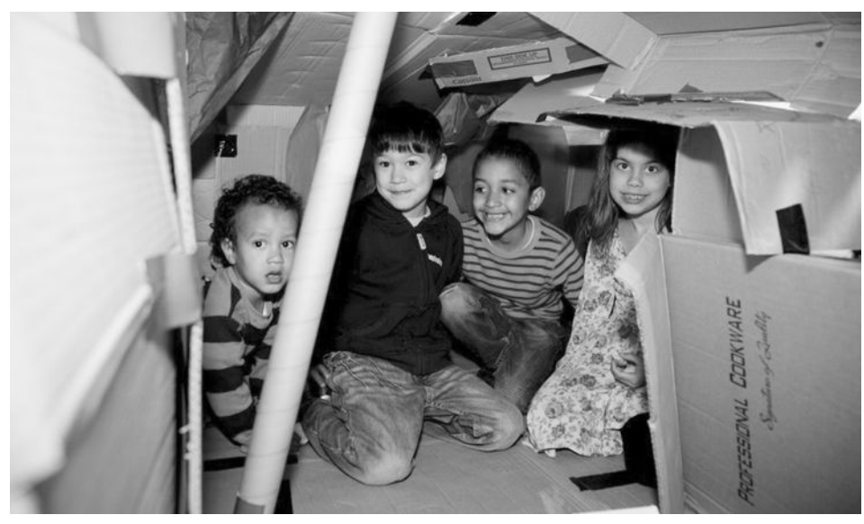
Cardboard City spontaneous and temporary building- see page 3

Everyone living in the Brockley Conservation area is automatically a member of the Brockley Society. The Brockley Society welcomes all.