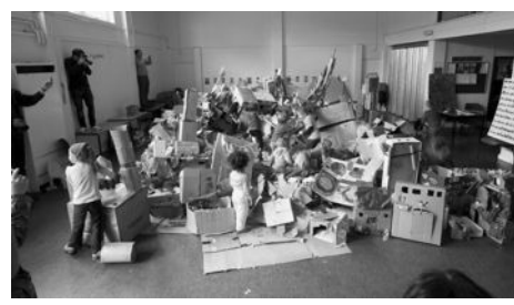
Smashing it up was also fun!

On Saturday, after an hour's viewing, at exactly 12 noon the children trampled the city down. This was an amazing moment, the best part of the week. As the kids jumped on the city, a strange and powerful atmosphere filled the room with an unplanned and yet controlled expression of destruction.