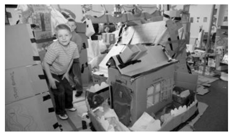
Endless fun building the city

It was a free, interesting, indoor activity over the half term holiday when the weather wasn't good, attended by children and families from the surrounding estates, from