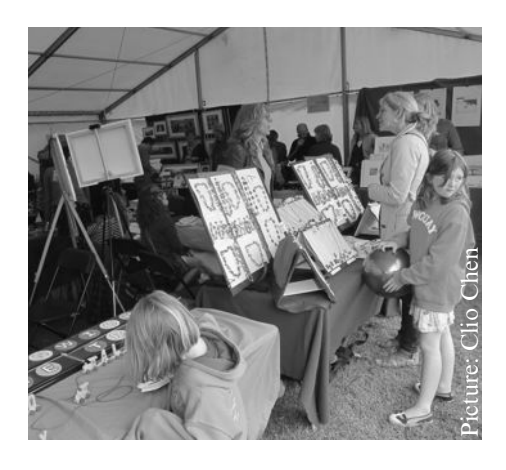
Thank you to everyone who volunteered their help!

Thanks to our sponsors : Cannon Kallar Estate Âgents, Saxton & Co Estate Agents, The Orchard Bar + Kitchen, Miracle Fitness Outdoor Bootcamps, Leaf London, J&M Community Soccer School.