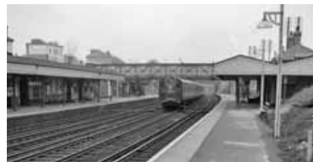
A public entrance to Brockley Station used to exist from the 6 Mantle Road site, on the left of this picture