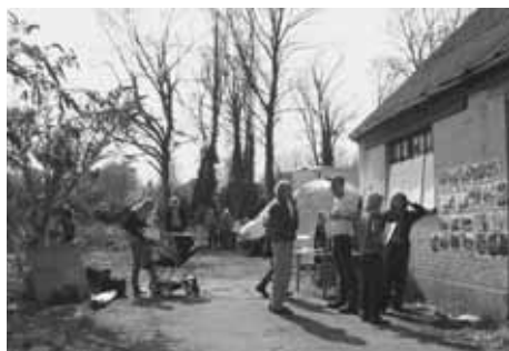
Sunshine and birdsong for the Breakspears Mews Open Day in March

We are delighted that Lewisham Council has now granted planning permission for a Community Garden to be created at the end of Breakspears Mews.