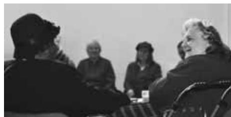
Pensioners from Peabody and Tanner's Hill estates and beyond enjoyed looking at pictures and maps of the area

Part of the answer may lie in the design and position of Peabody's Vanguard Estate, in which this event took place. Much of the old housing around here was demolished in the 1970s. Houses on Friendly Street, Albyn Road, Lucas Street, Vanguard Street, and Horton Street – mostly council owned houses, were replaced by the new estate. I asked some people what they thought of this change at the time, and many still couldn't understand it. One woman had to move out of her house on Oscar Street to accommodate the new development. The new buildings were cheaply constructed, though they had slightly bigger gardens, and