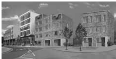
An alternative suggestion from Brockley Society