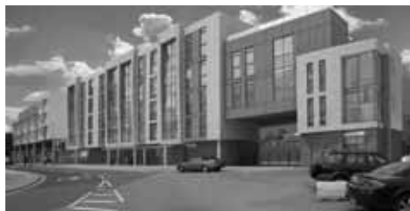
Developers' proposed design for 6 Mantle Road, opposed by Brockley Society

www.ipetitions.com/petition/planning-6mantleroad