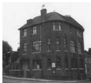
The Whidbourne Institute, formerly on the corner of Friendly Street and Albyn Road, now part of the Peabody Estate

As an historical aside – one of the buildings that had been demolished for the Peabody estate was the Whidbourne Institute. This was a charitable clubhouse that provided facilities