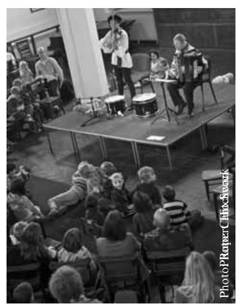
Peter and the Wolf at Brockley Max