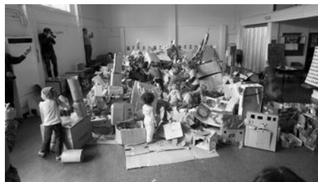
Smashing it up was also fun!