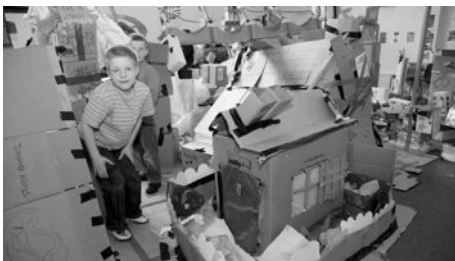
Endless fun building the city

It was a free, interesting, indoor activity over the half term holiday when the weather wasn't good, attended by children and families from the surrounding estates, from