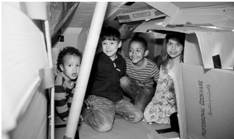
Cardboard City spontaneous and temporary building- see page 3

Everyone living in the Brockley Conservation area is automatically a member of the Brockley Society. The Brockley Society welcomes all.