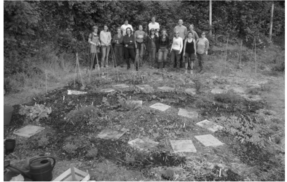
Edible Garden: Planting of herbs, salad leaves and vegetables has begun and will be continued at the community garden by Brockley Station. Come and watch it grow and sample the produce.