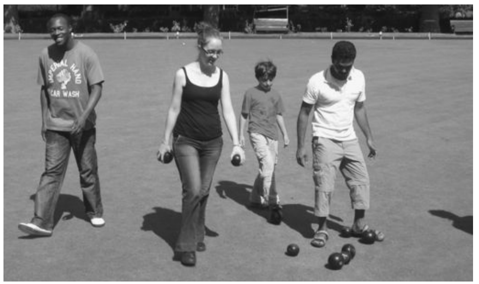
Bowls participants traverse the green

For more info contact Mick or Jeanette on 020 8291 9243234