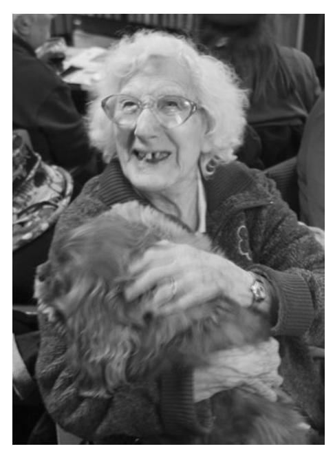
Pippa the Pets as Therapy dog brought a lot of joy