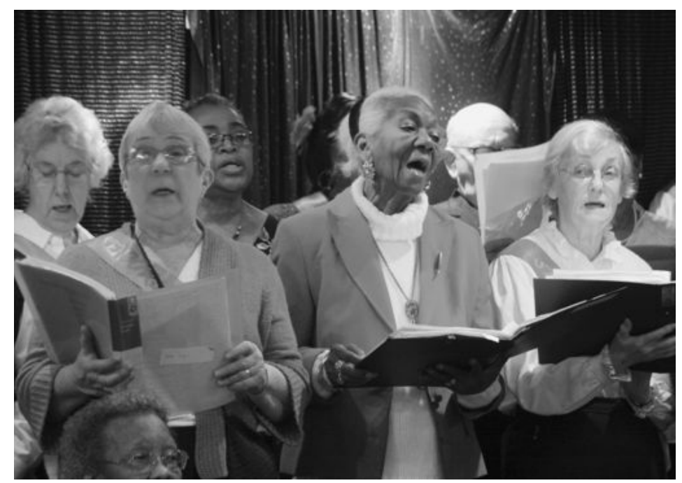
The ladies of the Seniors Choir and Entertainers